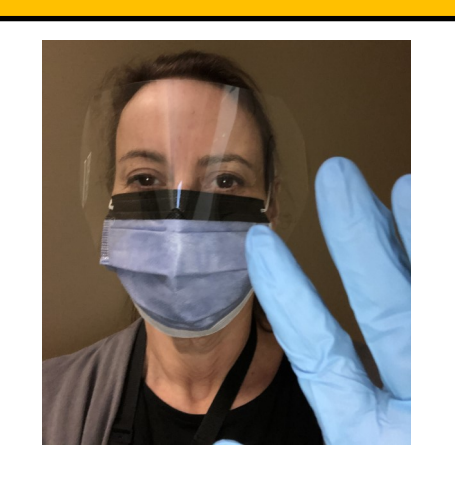
A Mask Can Look Scary

Their face is covered and you can't see if they are smiling.