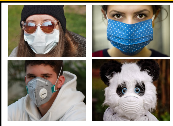
There are Different Masks

They all do the same thing protect you and them.